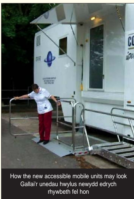
How the new accessible mobile units may look Gallai'r unedau hwylus newydd edrych rhywbeth fel hon

Wrth i Bron Brawf Cymru roi rhaglen foderneiddio ar waith, bydd yr unedau sgrinio symudol ym mhob rhan o Gymru'n edrych yn dra gwahanol. Y nod yw gwneud yr unedau symudol newydd yn haws mynd iddyn nhw.