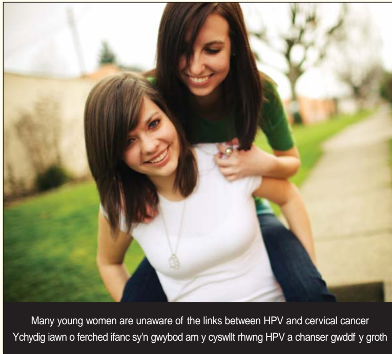
Many young women are unaware of the links between HPV and cervical cancer Ychydig iawn o ferched ifanc sy'n gwybod am y cyswllt rhwng HPV a chanser gwddf y groth

Mae ffactorau eraill fel ysmegu a nifer y partneriaid rhywiol yn gallu cynyddu'n sylweddol y perygl o gael clefyd HPV a chanser gwddf y groth. Mae defnyddio condomau'n gallu helpu i ddiogelu merched rhag heintiau a chlefydon HPV, yn ogystal â heintiau eraill sy'n cael eu trosglwyddo trwy ryw.